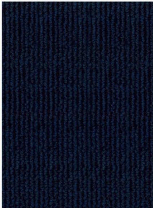
165 ROYAL NAVY