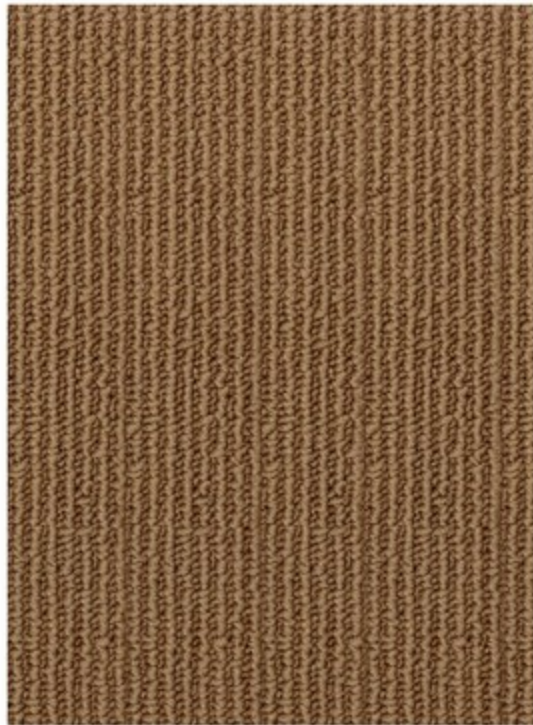
167 CANYON KHAKI