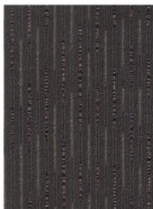
6785 ARCTIC SKY