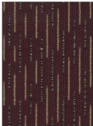
6275 CHINESE LACQUER