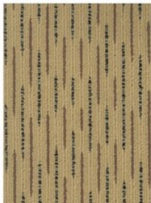
6975 SAVANNAH STRAW