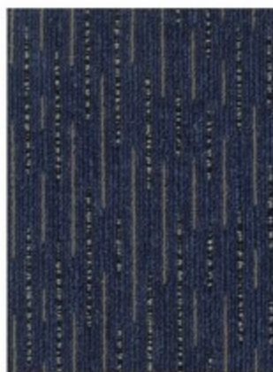
6545 FRENCH BLUE