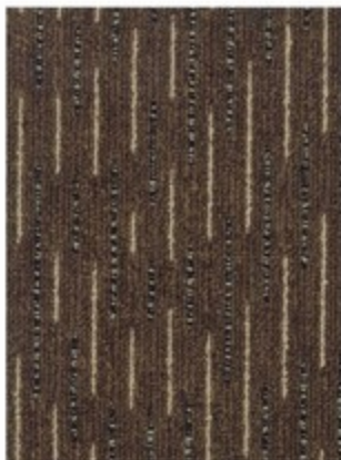
6985 WALNUT BROWN