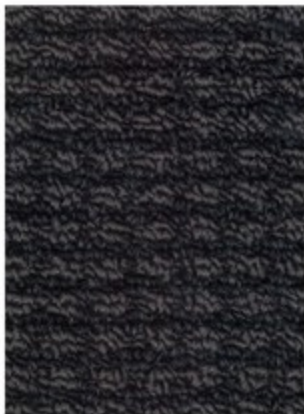
511 DAWN GREY