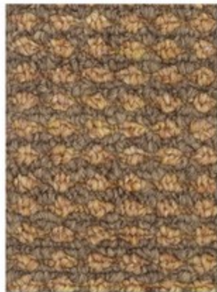
503 CORN HUSK