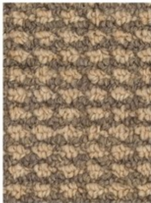
502 TIDAL GRAY