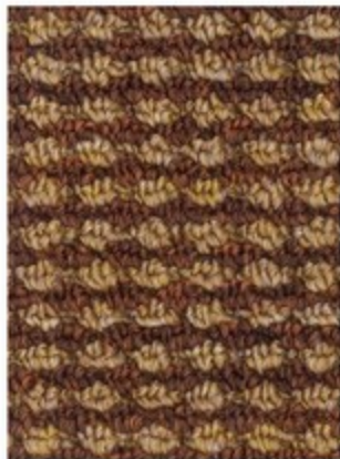
504 COCOA BROWN