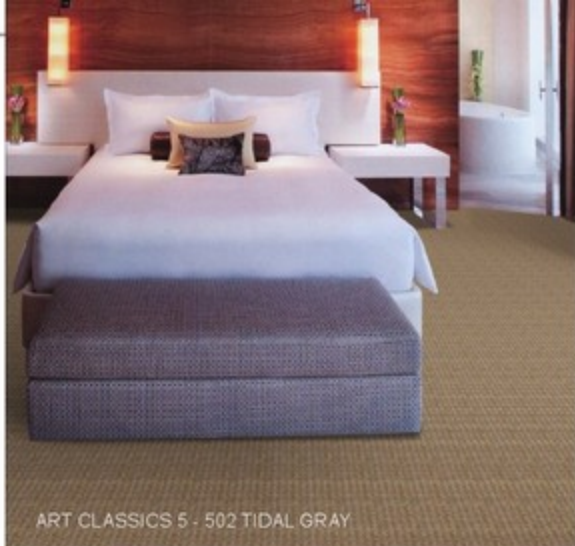
ART CLASSICS 5 - 502 TIDAL GRAY