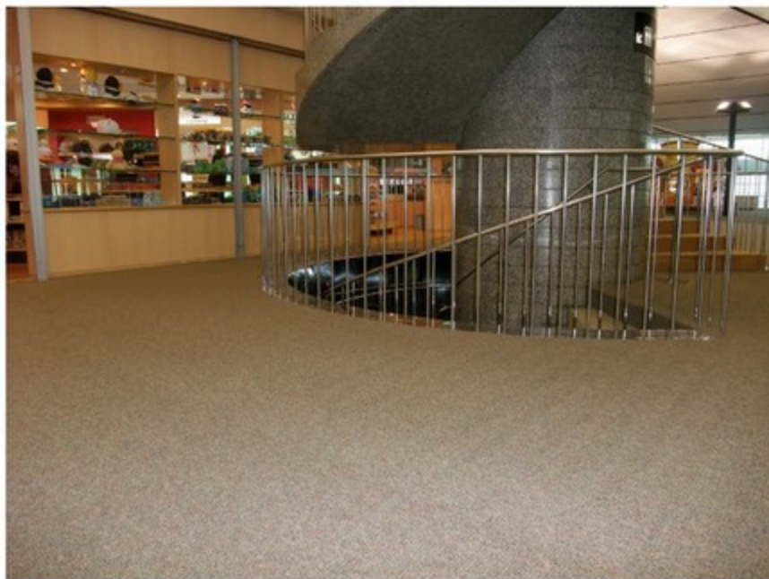
ELITE SPECCA - 665 CAMEL BRUNEI AIRPORT