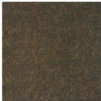
689 BURL WOOD