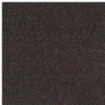
635 BLACK OPAL