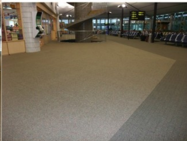
ELITE SPECCA - 665 CAMEL AND ELITE LINUM - 136 BUFF BRUNEI AIRPORT