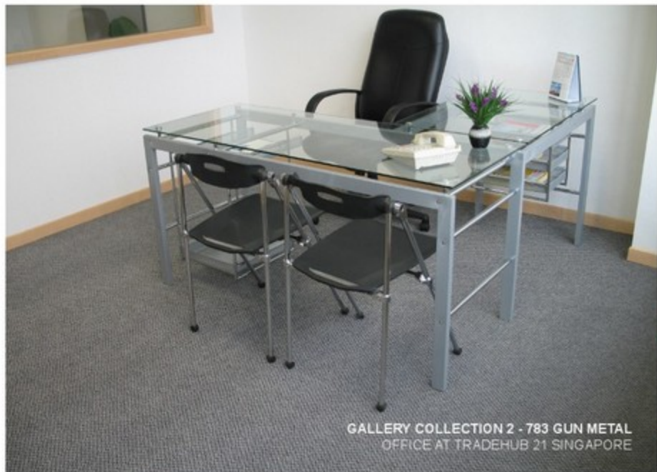
GALLERY COLLECTION 2 - 783 GUN METAL OFFICE AT TRADEHUB 21 SINGAPORE