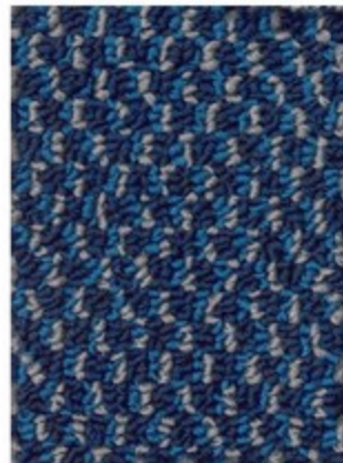
881 BRIGHT DENIM