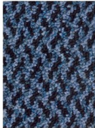
781 BLUE INDIGO