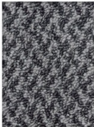
783 GUN METAL