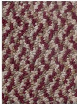
784 MULBERRY TWEED