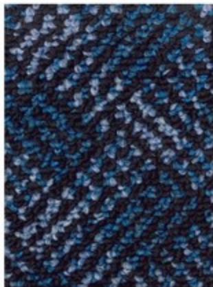
681 BIMINI BLUE