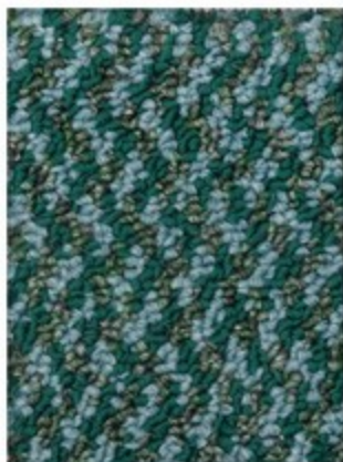
762 SILVERED JADE