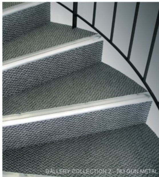
GALLERY COLLECTION 2 - 783 GUN METAL