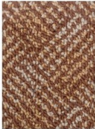
682 AUTUMN GOLD