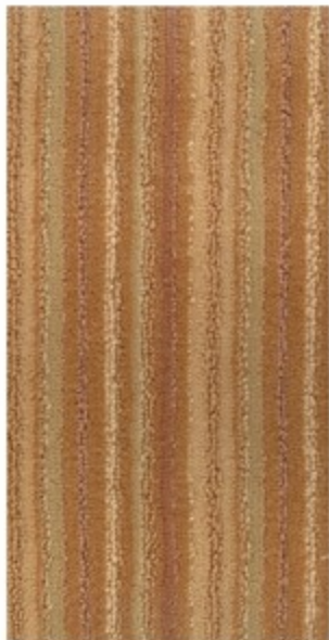
4632 GOLD COAST