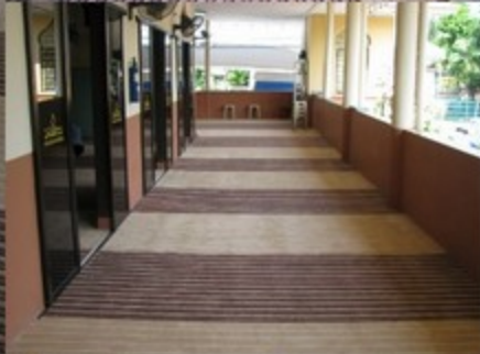
LAS VEGAS - 4635 LUXOR & 4632 GOLD COAST MASJID AL HUDA MOSQUE SINGAPORE