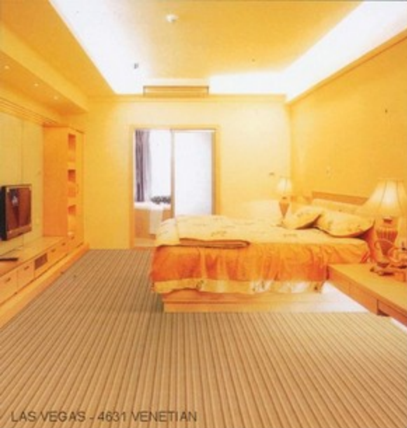
LAS VEGAS - 4631 VENETIAN