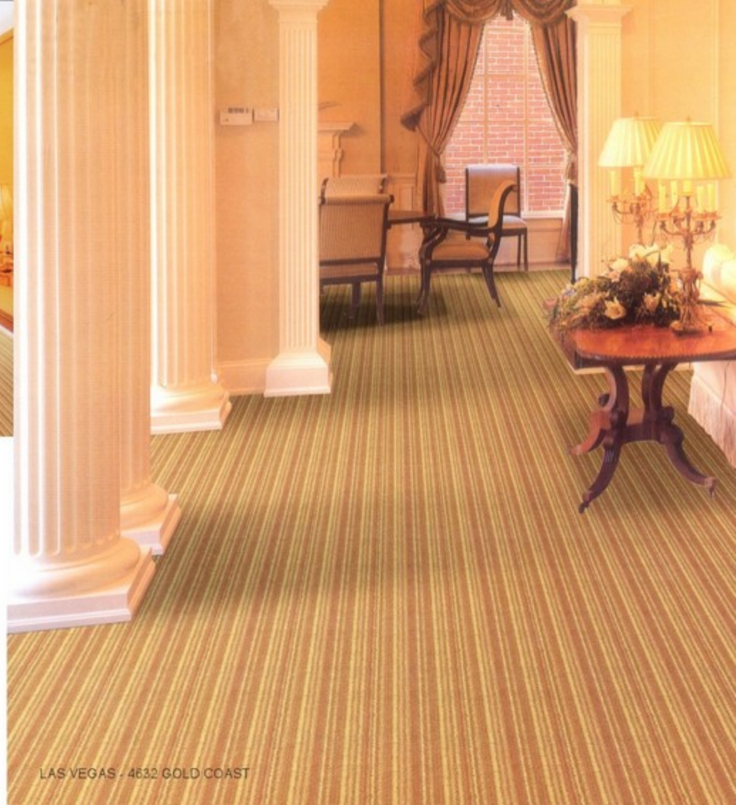
LAS VEGAS - 4632 GOLD COAST