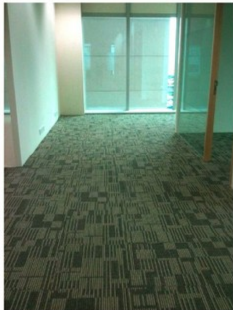
MANDATE 1 - 1823 GRENADA Office at International Business Park, Singapore