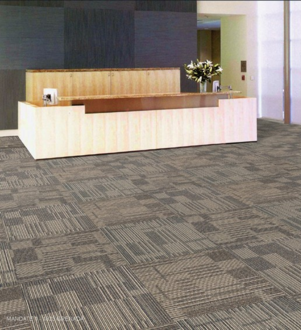
MANDATE 1 - 1813 GRENADA