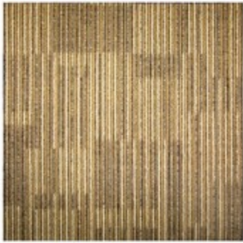
1821 JERICO TAN