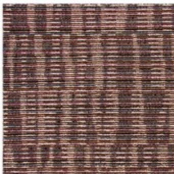
2844 RAVEL BROWN