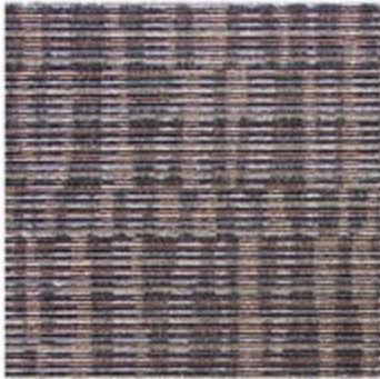
2847 GREY SUEDE