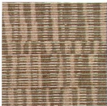
2841 GINGER BEIGE