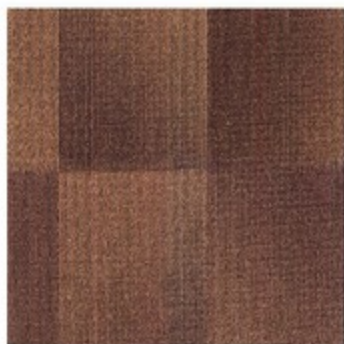
5803 GLAZED OAK