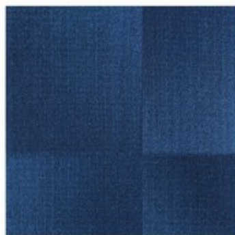
5806 RHYME BLUE