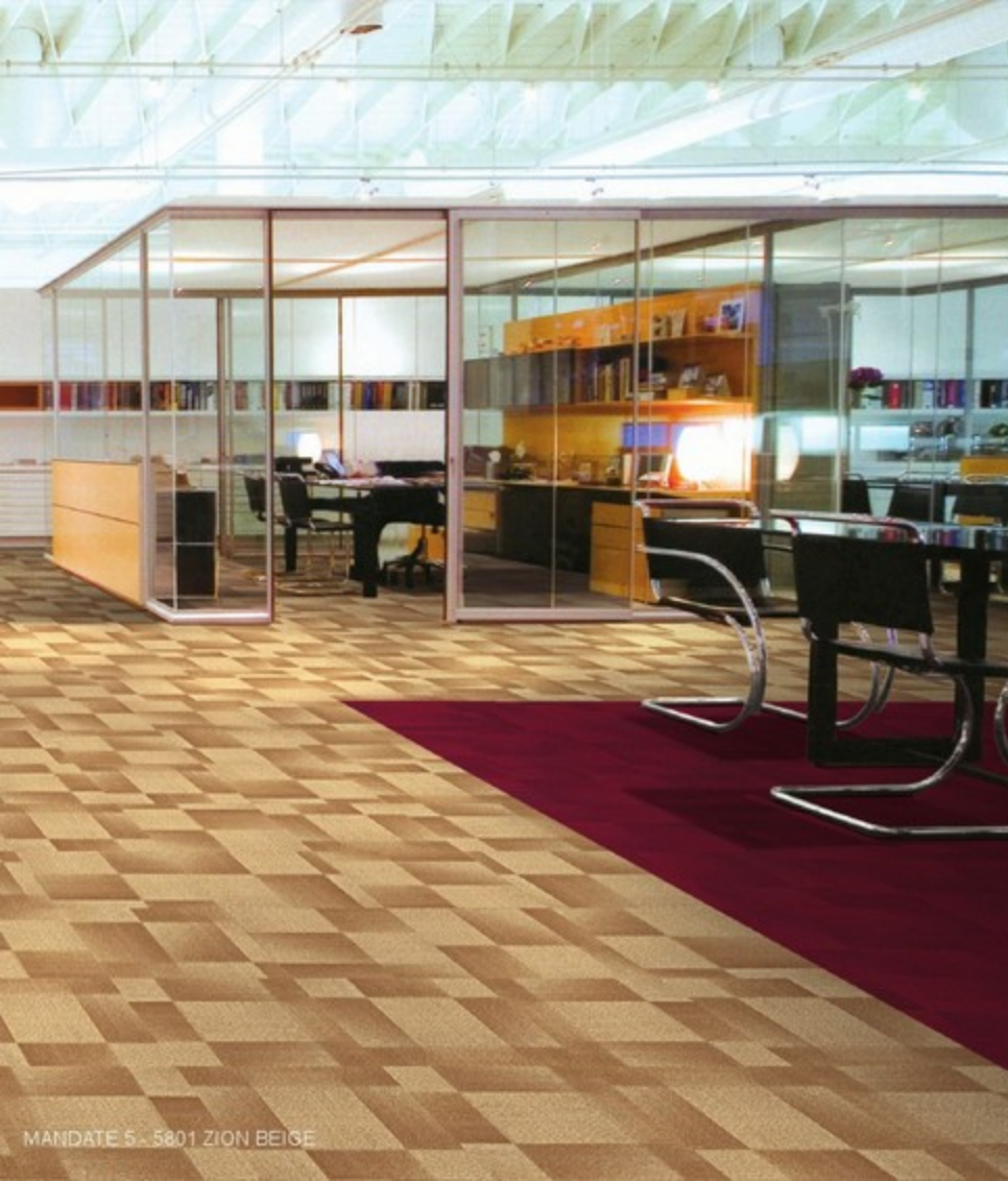
MANDATE 5 - 5801 ZION BEIGE