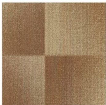
5801 ZION BEIGE