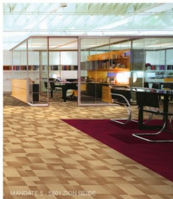
MANDATE 5 - 5501 ZION BEIGE