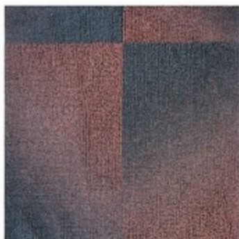
5805 VAPOR BROWN