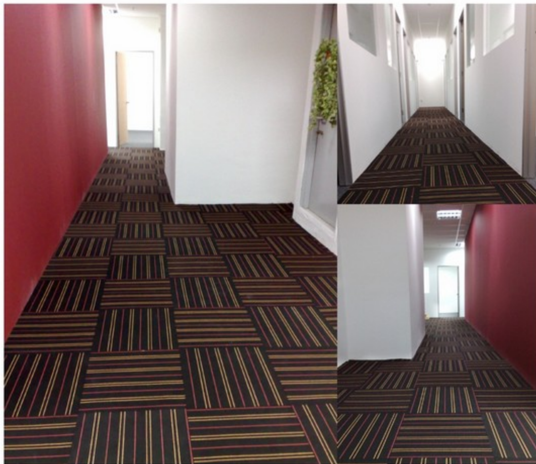
MASCOT - 6703 BLACK PHANTER (Office at Pantech Industrial Bldg, Singapore)