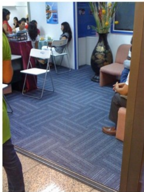
MASCOT - 6706 BLUE BEYOND (Office at Lucky PLaza Bldg, Singapore)