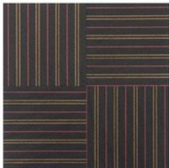
6703 BLACK PANTHER