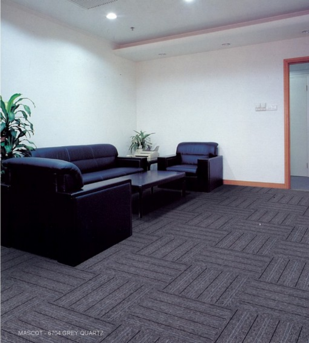
MASCOT - 6704 GREY QUARTZ