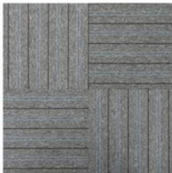
6704 GREY QUARTZ