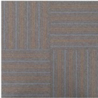
6705 COPPER GLOSS