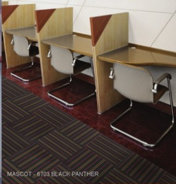
MASCOT - 6703 BLACK PANTHER