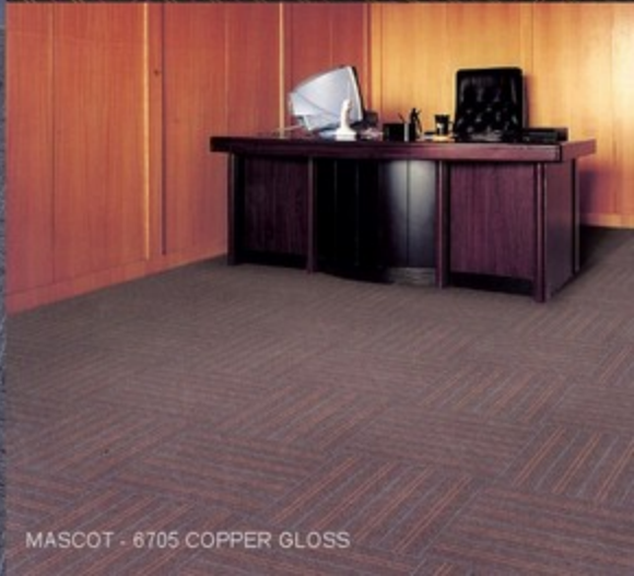
MASCOT - 6705 COPPER GLOSS