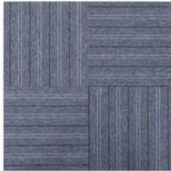
6706 BLUE BEYOND