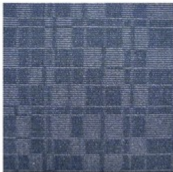
3666 LONDON BLUE