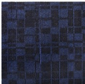
3668 ROYAL BLACK