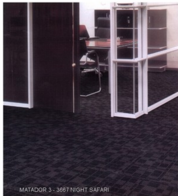
MATADOR 3 - 3667 NIGHT SAFARI