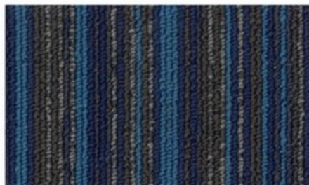
1365 CONTINENTAL BLUE