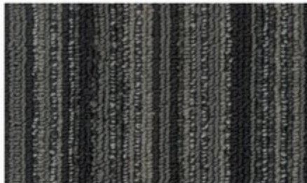
1362 GLACIER GREY