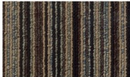
1364 RICH EARTH