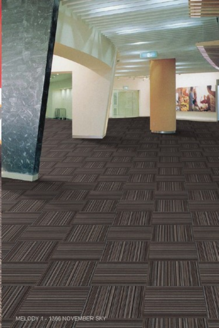
MELODY 1 - 1366 NOVEMBER SKY