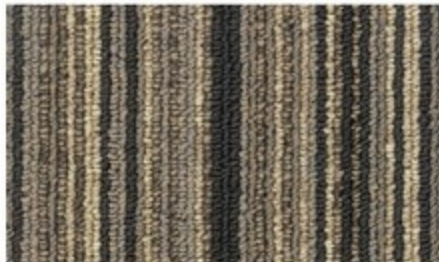
1361 MALIBU SAND