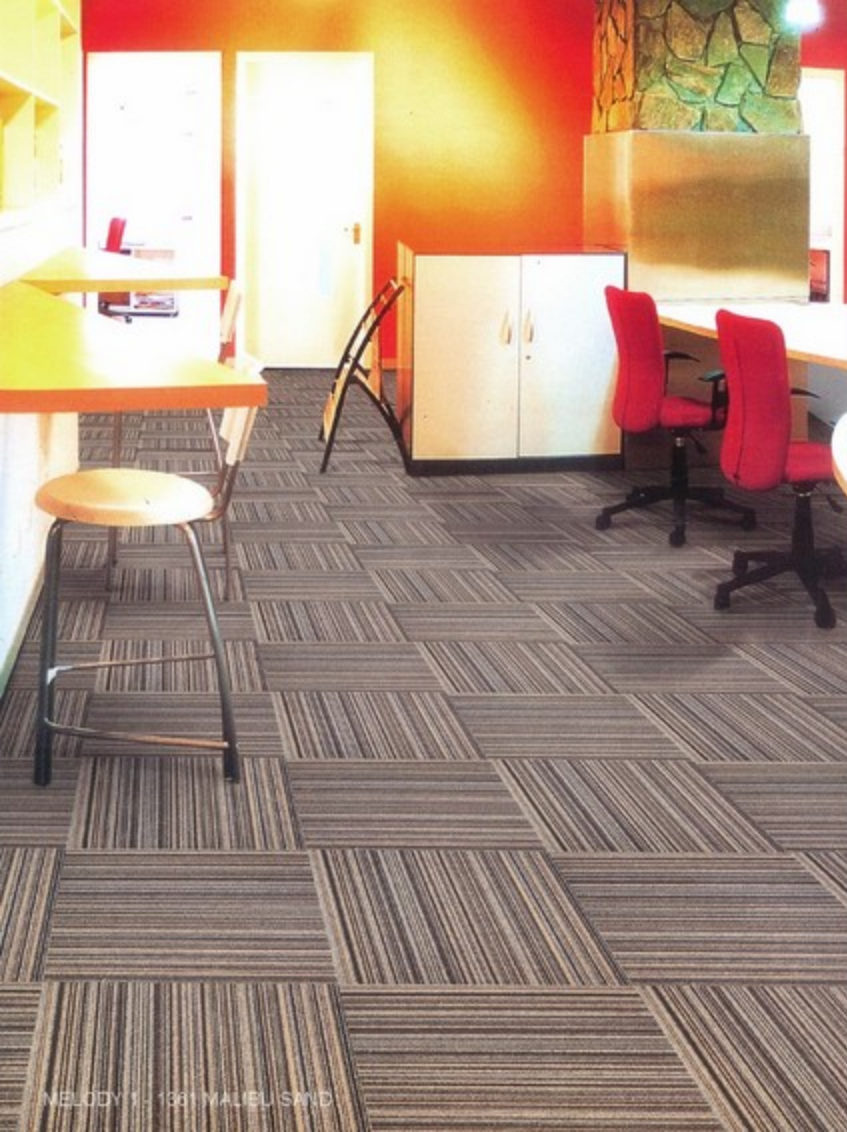
MELODY 1 - 1366 MAJELI SW/D