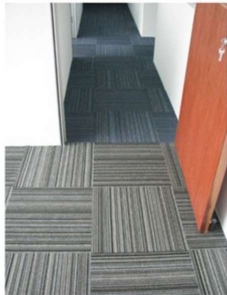
MELODY 1 - 1366 NOVEMBER SKY AND 1365 CONTINENTAL BLUE (Office at the Central Singapore)