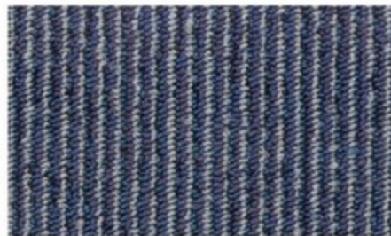
2388 CALICO BLUE