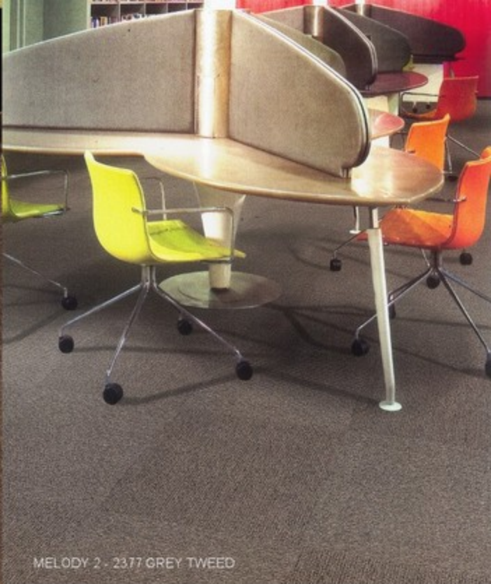
MELODY 2 - 2377 GREY TWEED