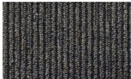
2378 BLACK FOREST