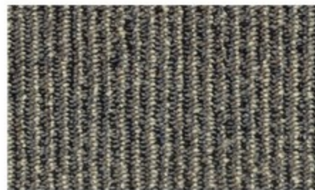
2377 GREY TWEED