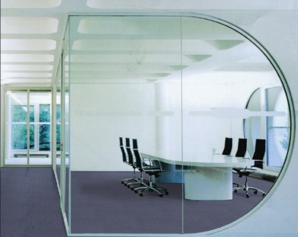
MELODY 2 - 2388 CALICO BLUE