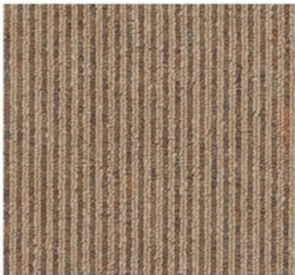
6201 BRONZE FIRE