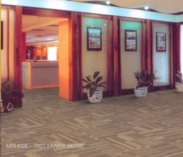
MIRAGE - 7007 TAWNY BEIGE