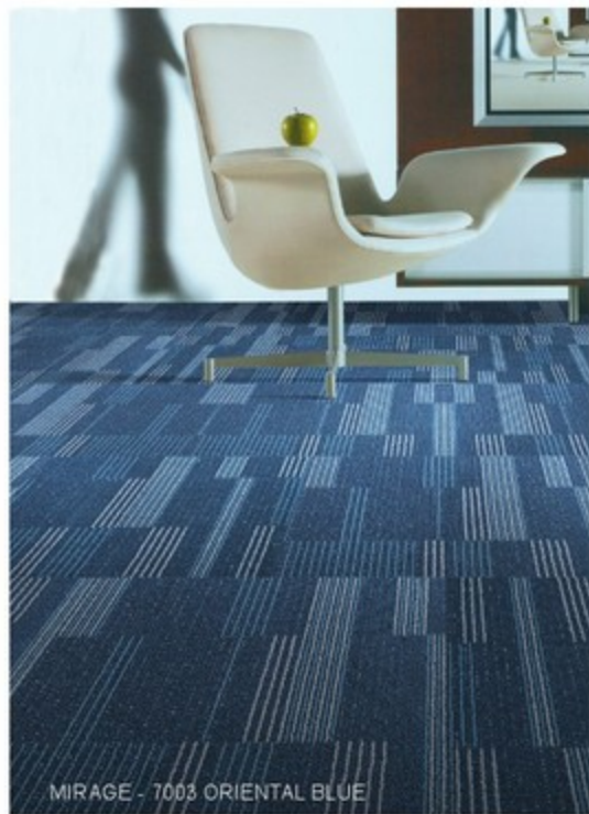
MIRAGE - 7003 ORIENTAL BLUE