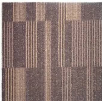
7006 MOCHA DELIGHT