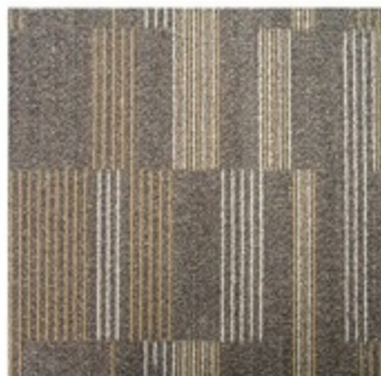
7007 TAWNY BEIGE