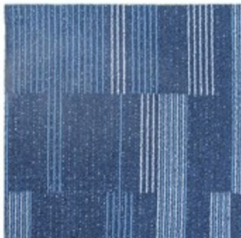
7003 ORIENTAL BLUE