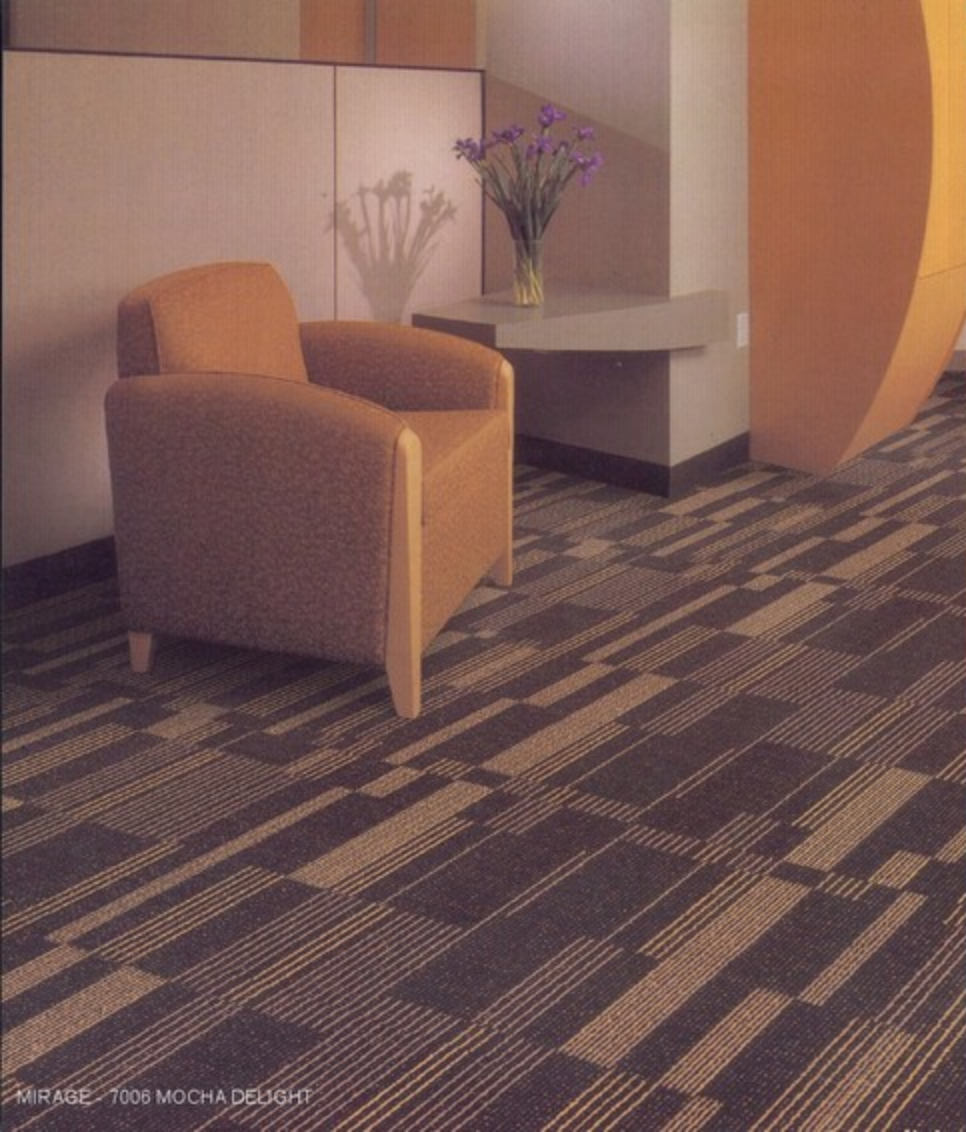
MIRAGE - 7006 MOCHA DELIGHT