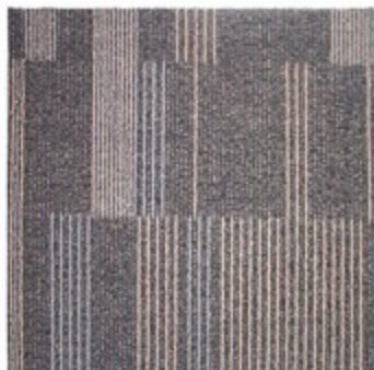
7001 MIDNIGHT MOODS