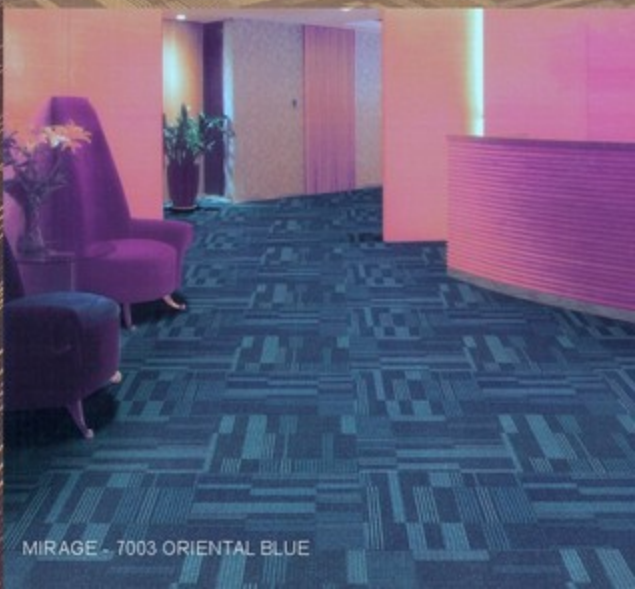
MIRAGE - 7003 ORIENTAL BLUE