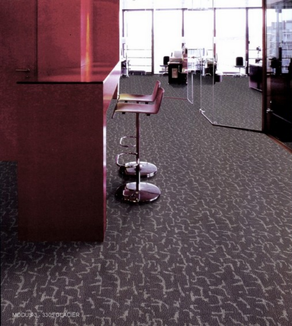
MODUS 3 - 3305 GLACIER