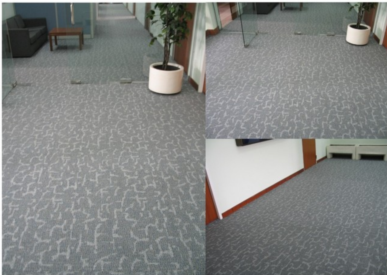
MODUS 3 - ANTARCTICA 3306 FIRETHORN Admin Office Hoyany Offshore, Singapore