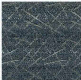
6314 STAR SAPPHIRE