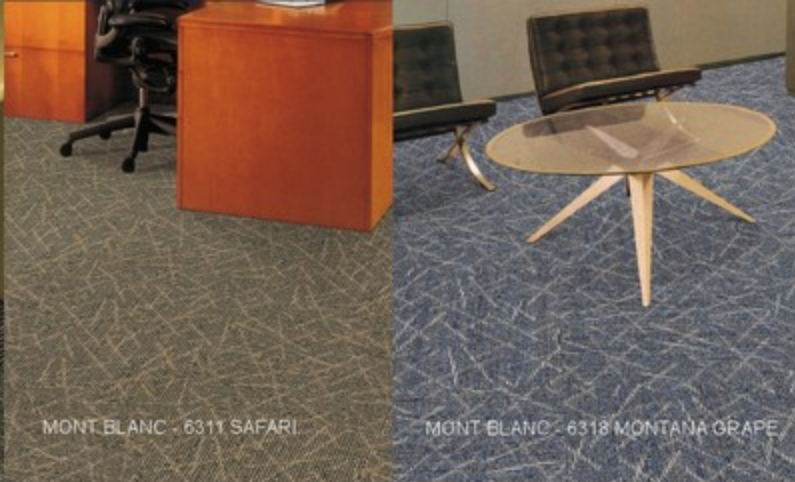
MONT BLANC - 6311 SAFARI