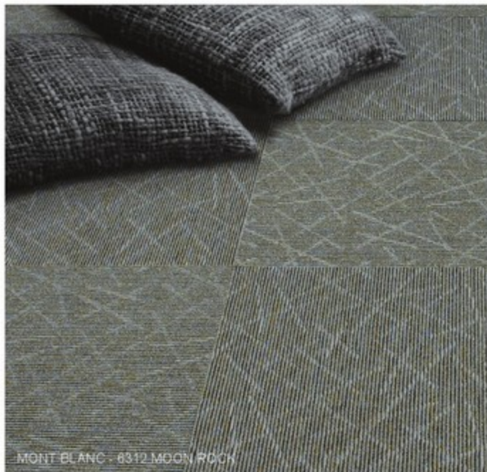
MONT BLANC - 8312 MOON ROCK