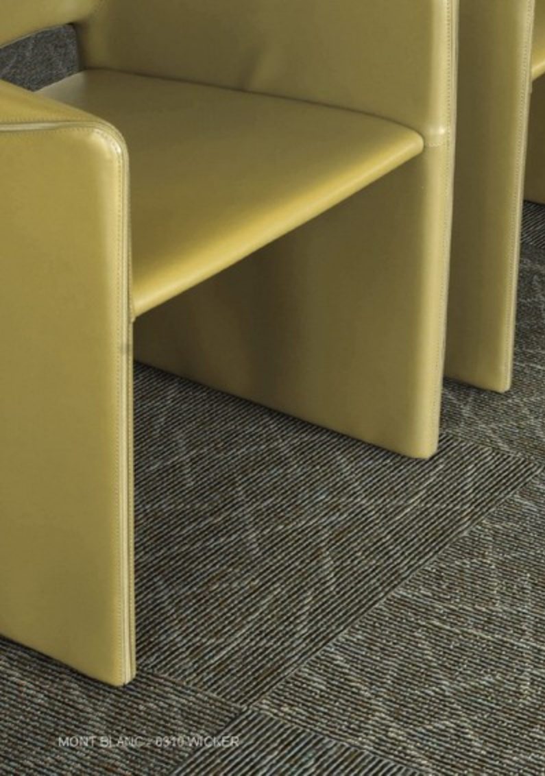
MONT BLANC - 6310 WICKER