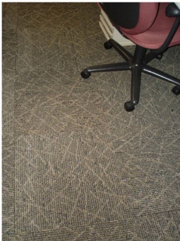
MONT BLANC - 6311 SAFARI Bank Office at Shenton Way Singapore