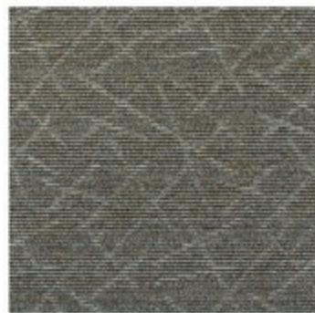
6312 MOON ROCK