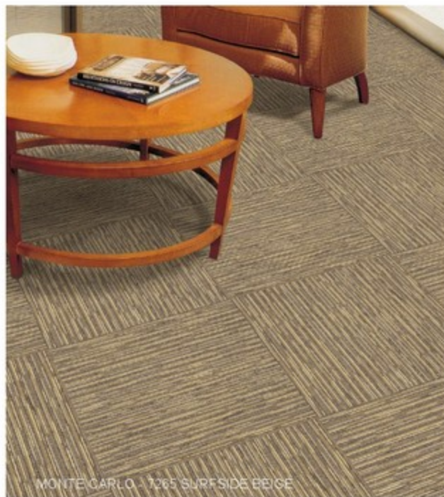
MONTE CARLO - 7265 SURFSIDE BEIGE