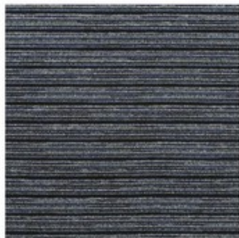
7261 ALFRESCO BLUE