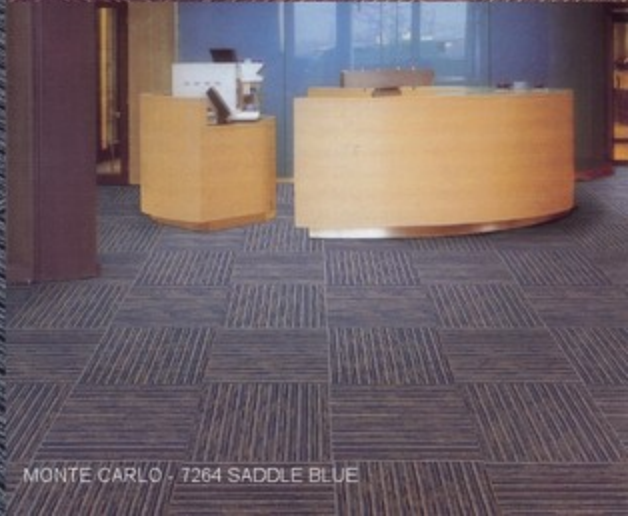
MONTE CARLO - 7264 SADDLE BLUE