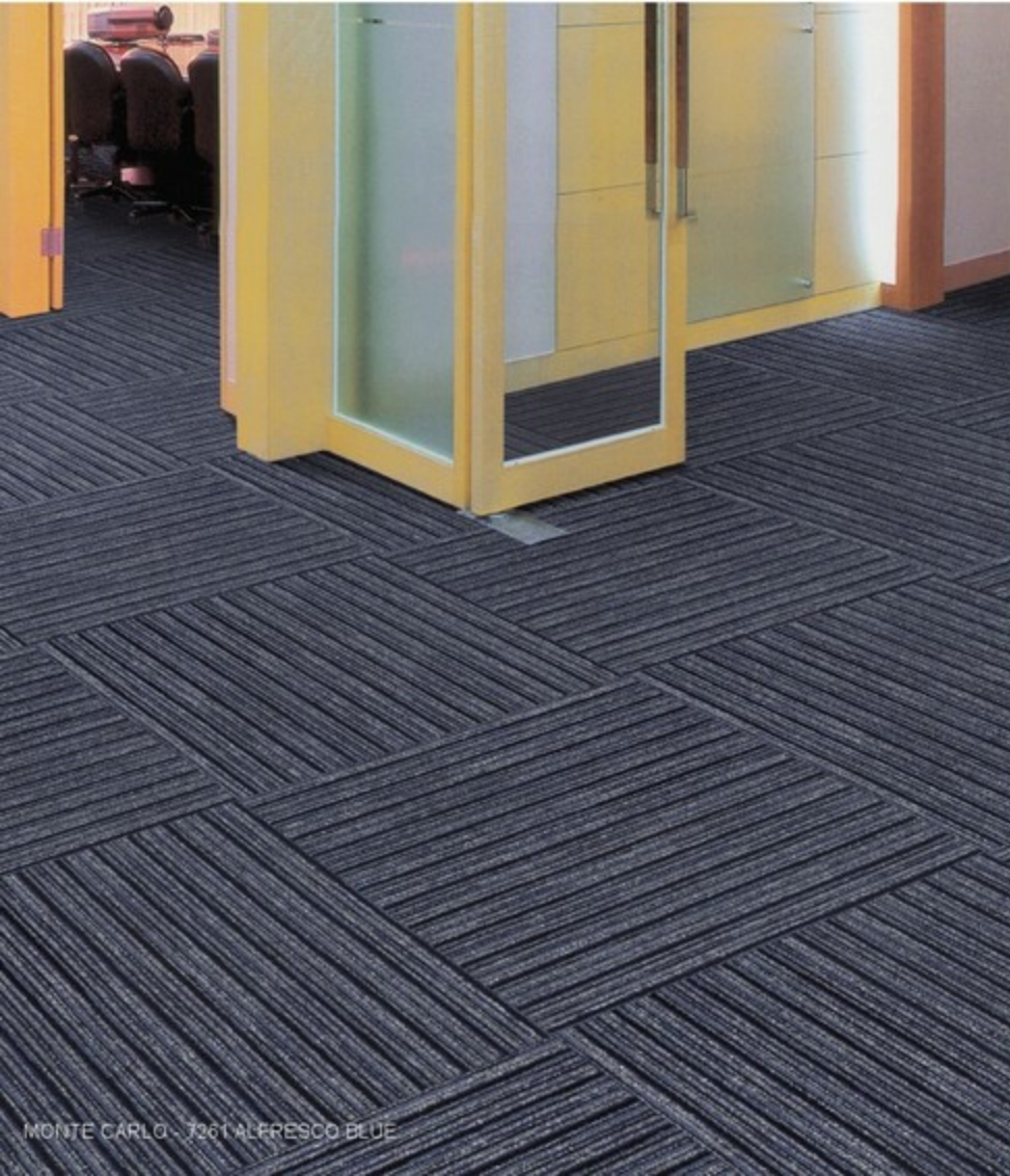
MONTE CARLO - 7261 ALFRESCO BLUE