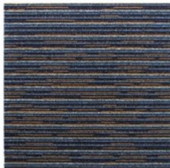
7264 SADDLE BLUE