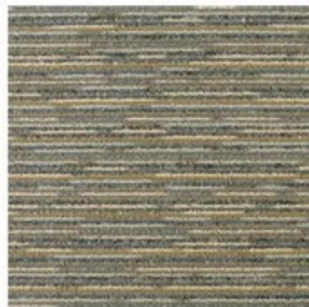
7265 SURFSIDE BEIGE