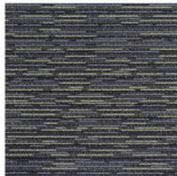
7263 SILVER STROKE