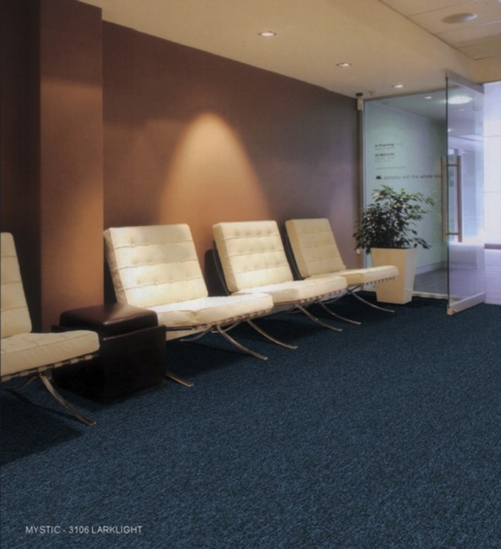
MYSTIC - 3106 LARKLIGHT