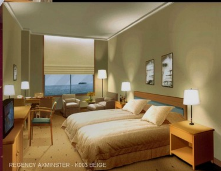
REGENCY AXMINSTER - K003 BEIGE