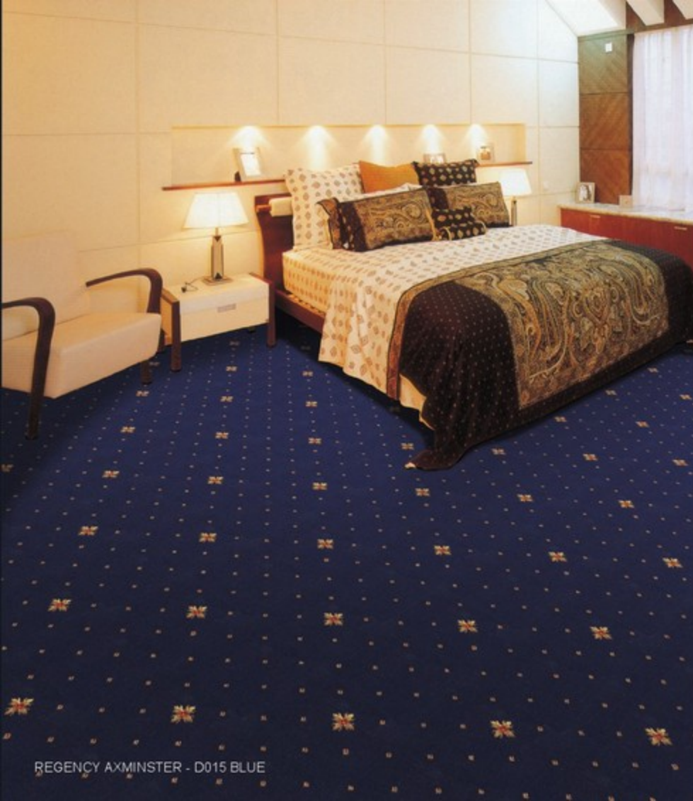
REGENCY AXMINSTER - D015 BLUE