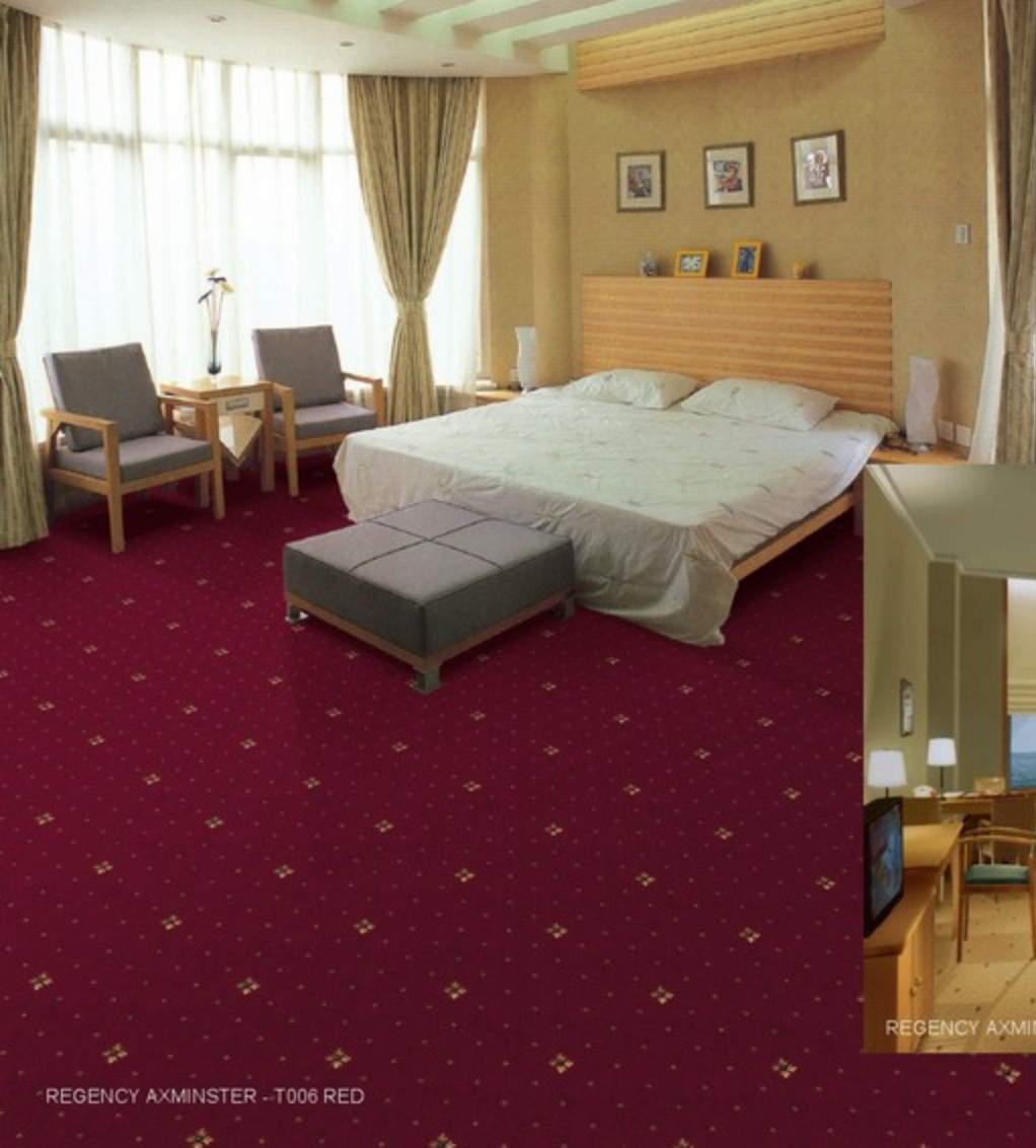
REGENCY AXMINSTER - T006 RED