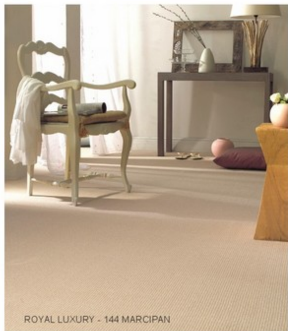
ROYAL LUXURY - 144 MARCIPAN