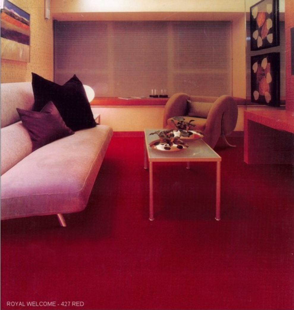
ROYAL WELCOME - 427 RED