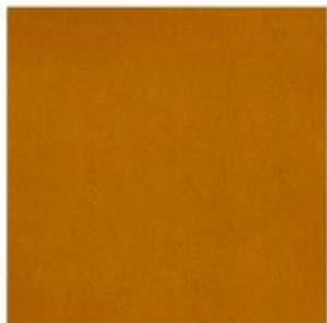
1357 ROYAL GOLD