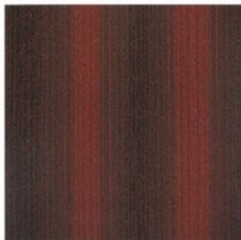
6798 ORC BROWN