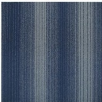
6793 VIO BLUE