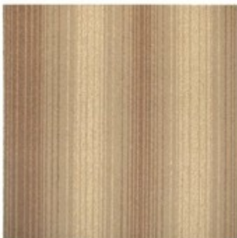
6795 COACH BEIGE