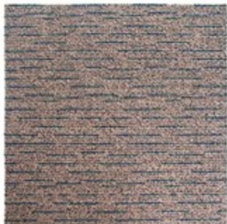
3845 - SAND STORM