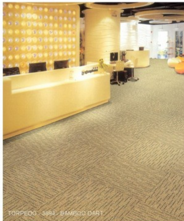
TORPEDO - 3694 - BAMBOO DART