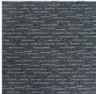
3878 - SHOOTING STAR