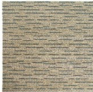
3894 - BAMBOO DART