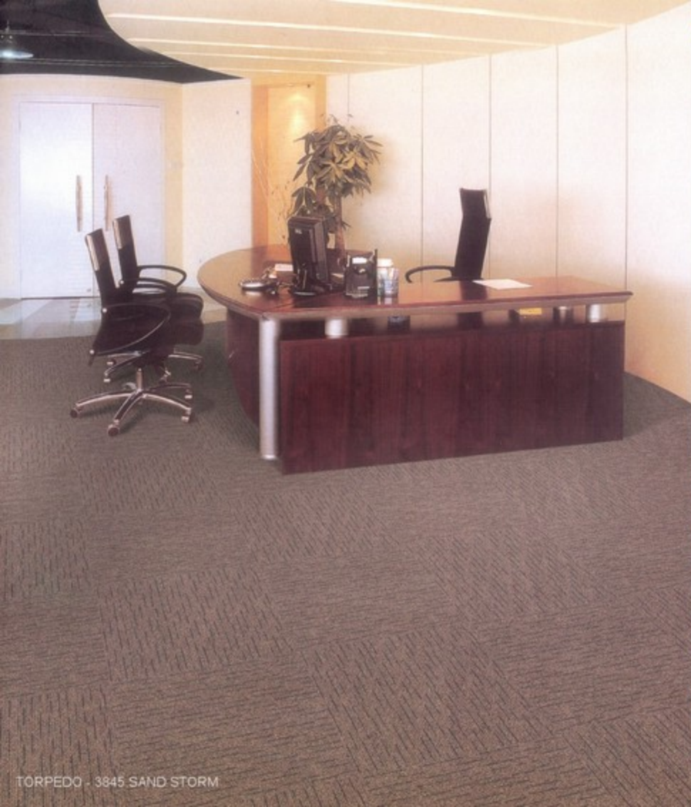
TORPEDO - 3845 SAND STORM