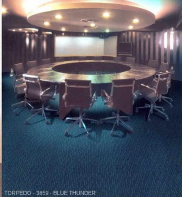
TORPEDO - 3859 - BLUE THUNDER