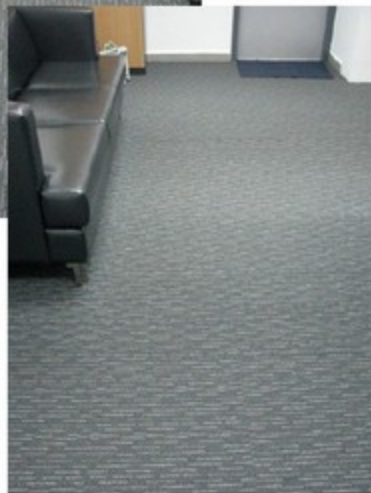
TORPEDO - 3878 SHOOTING STAR Office at Kian Tech Way, Singapore