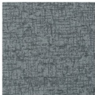
957 MID GREY