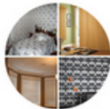
WOODEN / VINYL FLOORING