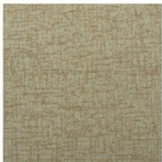
14 PEARL SAND