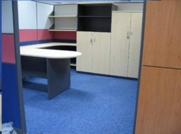
TOSCANA - 524 NEPTUNE Office at Tyco Bldg, Singapore