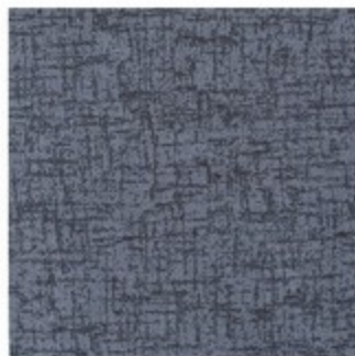
910 DARK GREY