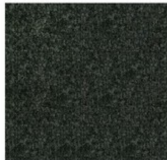
9136 DARK OLIVE