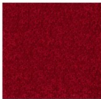
9123 MARS RED