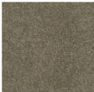
9133 SILVER COAT