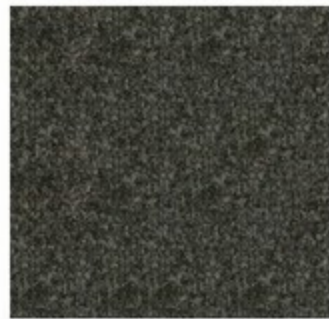
9152 COSMO GREY