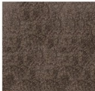
9134 CONCORD MIST