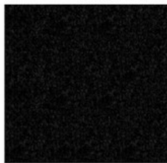
9148 ONYX BLACK