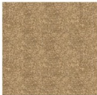
9129 URBAN BEIGE