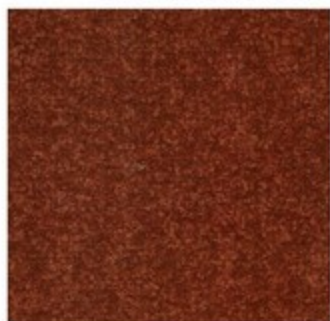
9124 TECHNO RUST