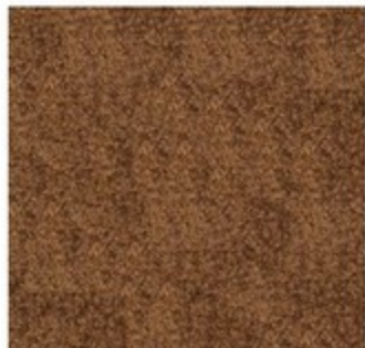
9120 ABSOLUTE MOCHA