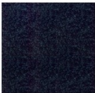
9147 DYNO BLUE