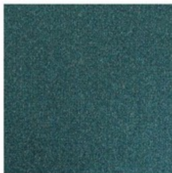
615 SHERWOOD GREEN