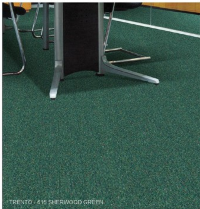
TRENTO - 615 SHERWOOD GREEN