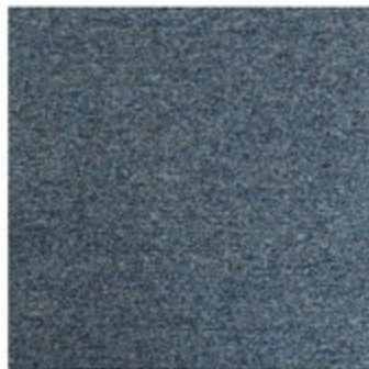
517 STEEL BLUE