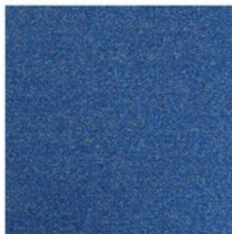
566 SIGNAL BLUE