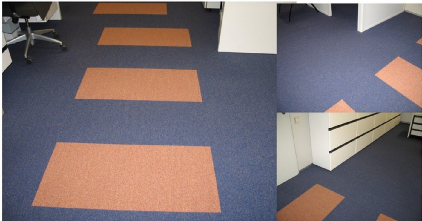
Trento - 550 Cobalt (Orchard Office Singapore)